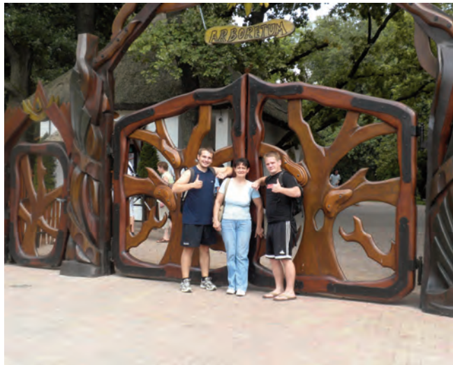
The Gates of the Arboretum