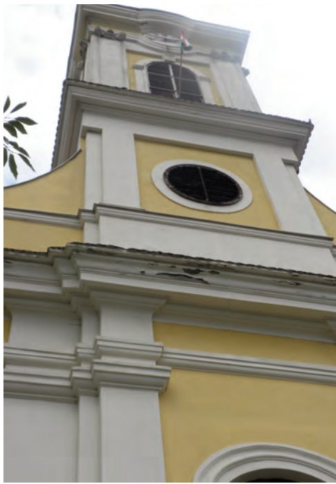
The Samuel Tessedick Museum

The institution today is a collection of 5 areas comprising 82 hectares. Some of the other tasks of the arboretum involve education, research, and cultivation. In 1985, the Horticulture and Food Industry